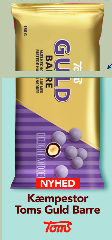
Poster + Top sign in separate files