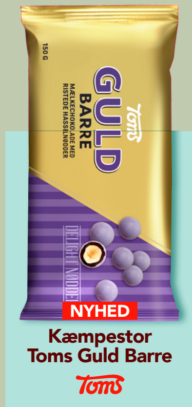
Work file (layout)