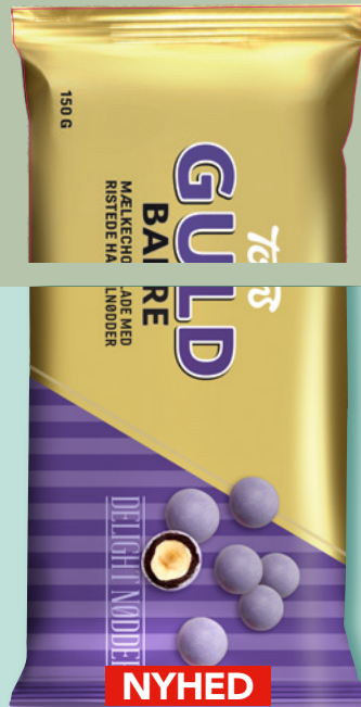
Work file (layout)