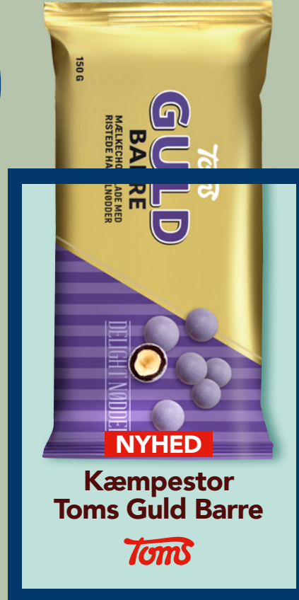
Poster + Top sign in separate files