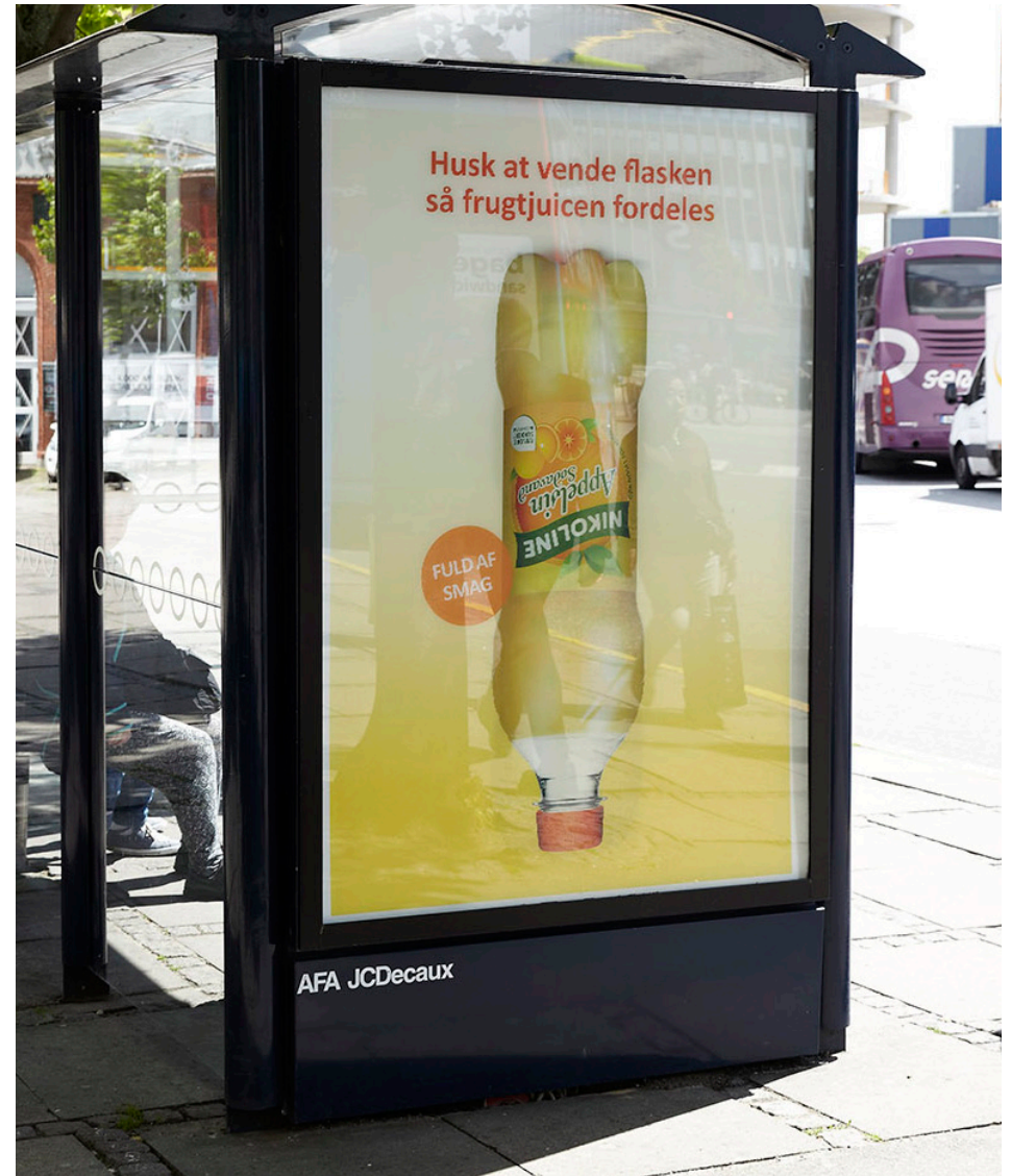
Print file B