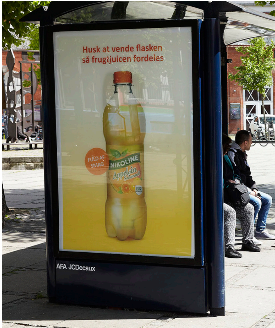
Print file A